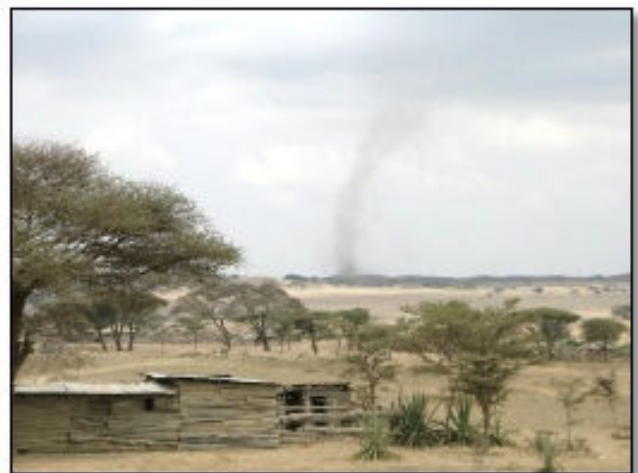
Current drought situation

Many of you are aware of the current famine which has gripped parts of East Africa and especially Northern Kenya where over 3 million people are facing starvation.. Relief efforts are underway to get much needed aid to those who need it most. This past month, a “Kenyans for Kenya” campaign was launched in which almost 1 million dollars was raised and pledged by ordinary Kenyans to help solve their own problem. This was such a turn around for a nation that has been so dependant on foreign aid. It has created a ripple of hope in the nation. Last week, following a terrible disaster in which 100's of people were burnt alive and many more still missing in an inferno caused by a leaking fuel pipe that ran through an overcrowded slum in Nairobi, the government has responded promptly with many corporations donating medical supplies and blankets and temporary shelter for the victims. With a new constitution now in place, there are drastic shifts in government structures and we believe that this will not only create an avenue for change in the government, but provide an avenue for change in the hearts of the people as the gospel goes out. Current debate is underway as to when the next hotly contested elections will take place. We covet your prayers as we declare peace over the nation leading up to this election.