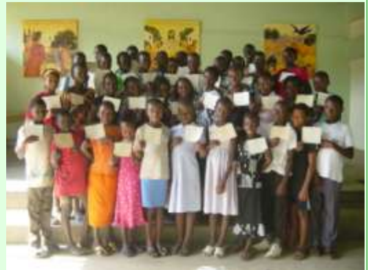
December Vocational Bible School Training graduates

This week we shall hold our annual youth camp.